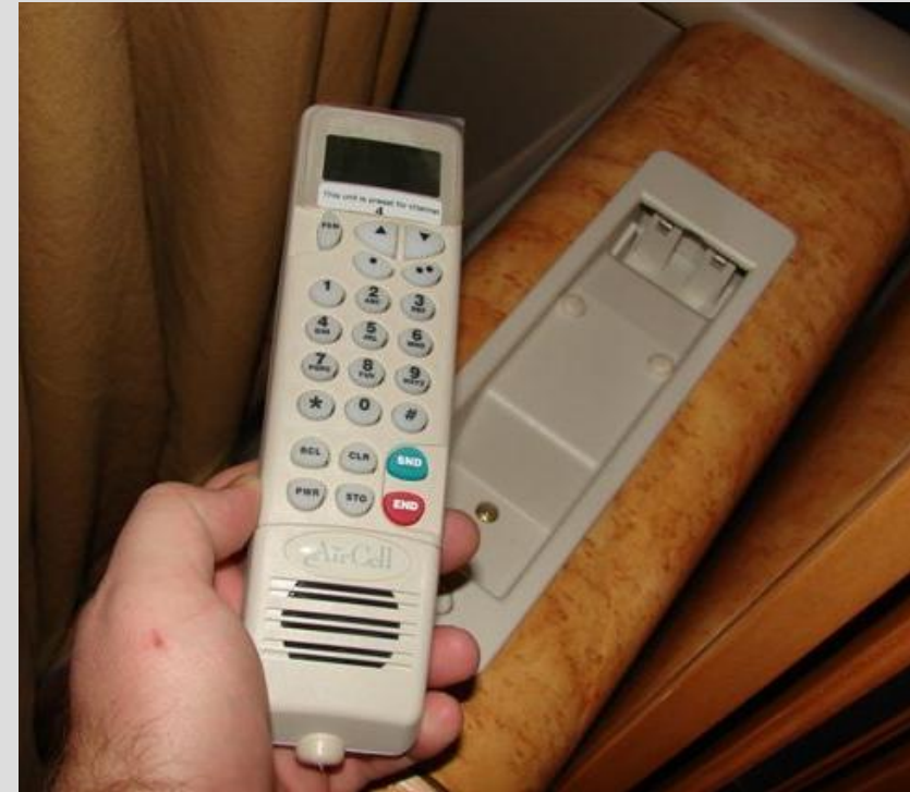
AirCell ST-3100 Flight Phone

Recently completed 60 Months Inspection ( Gear and Prop Overhaul ) Enrolled Rockwell Collins CASP Avionics (Pro-line 21)